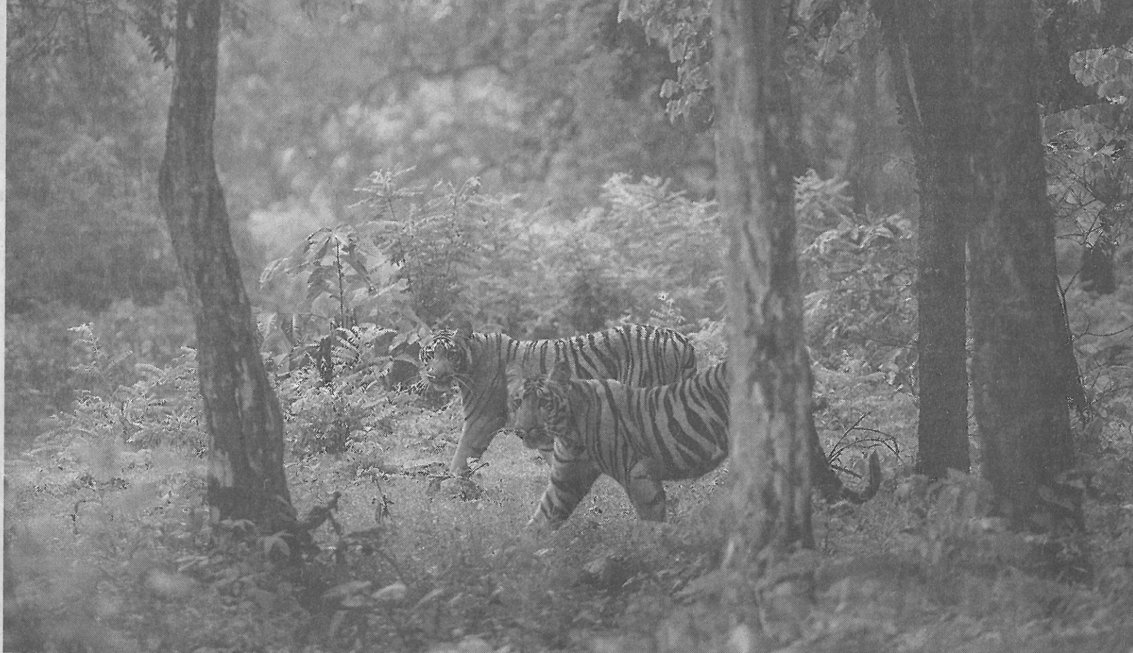
Above, tiger cubs moving through the jungle in Maharashtra State, India. Below, men in Vihirgaon after a nighttime patrol of their village looking for the 5-year-old man-eating tigress. Forest rangers are gearing up for a military-style operation to deploy sharpshooters on the backs of elephants to surround the tiger, capture her and send her to a zoo.