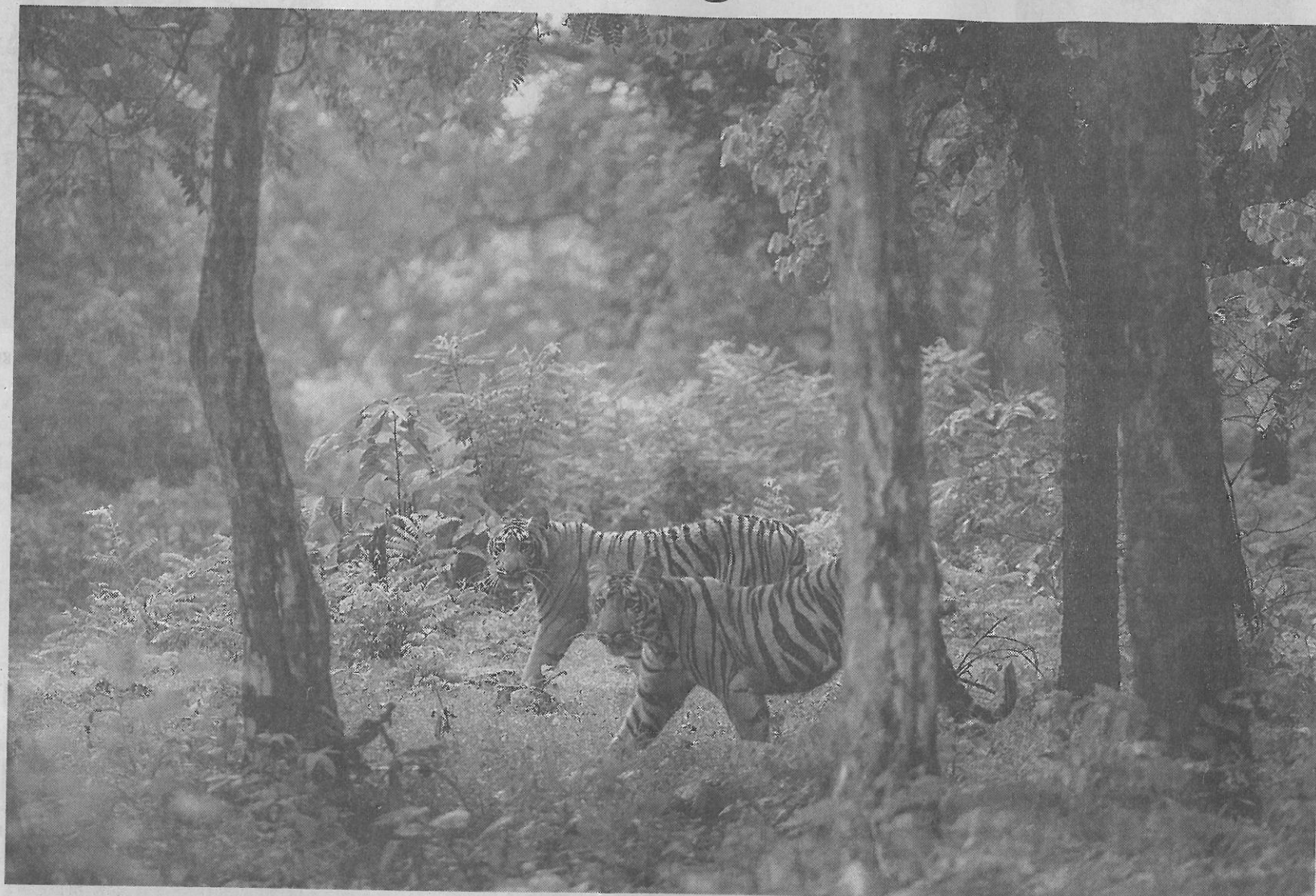
Above, tiger cubs moving through the jungle in Maharashtra State, India. Below, men in Vihirgaon after a nighttime patrol of their village looking for the 5-year-old man-eating tigress. Forest rangers are gearing up for a military-style operation to deploy sharpshooters on the backs of elephants to surround the tiger, capture her and send her to a zoo.